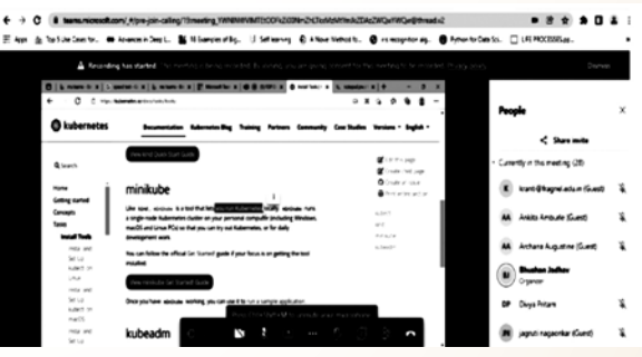
Introduction to Advance Cloud Computing, Docker and Kubernetes

situation the entire FDP was managed and hosted on online platform via video conferencing.