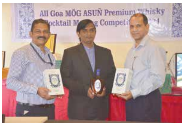
Mog Asun Brand