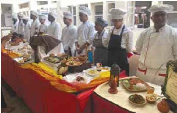
Participants with the Goan Food Display.