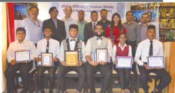
Winners With The Judges