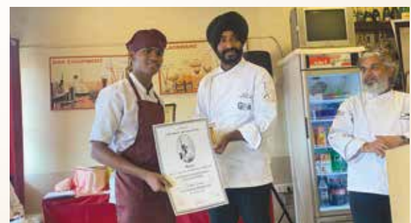
2nd Runner Award