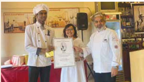
1st Runner Award

8 Hospitality and Catering Institutes participated in the competition namely, Guardian Angel Institute Of Hotel Management & Catering Technology, Curchorem, International Institute Of Hotel