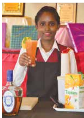
Judges Choice Winner