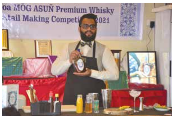
3rd Place Winner