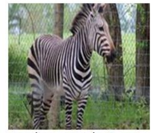
Ques: how many zebra? Answer: one