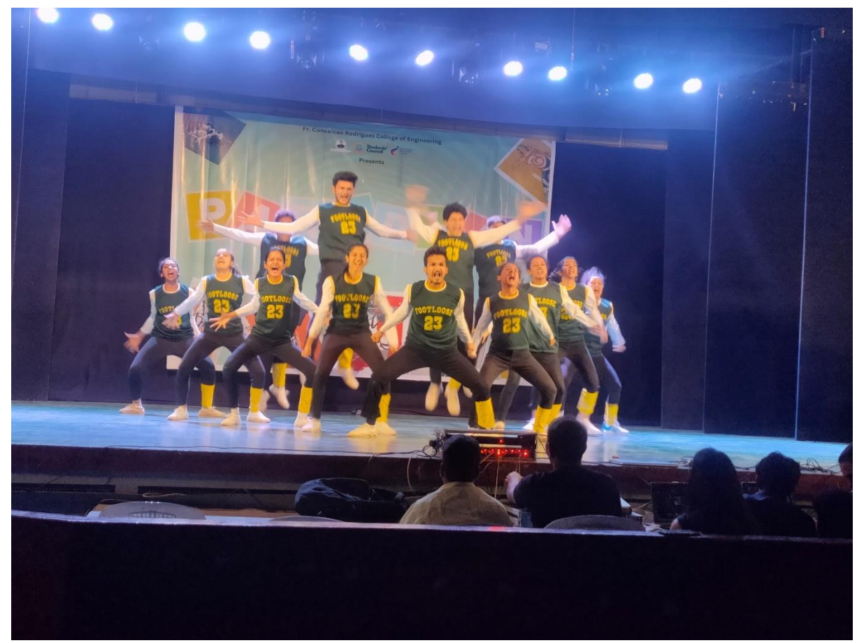
Paridhan – Dance competition (29<sup>th</sup> March 2023)