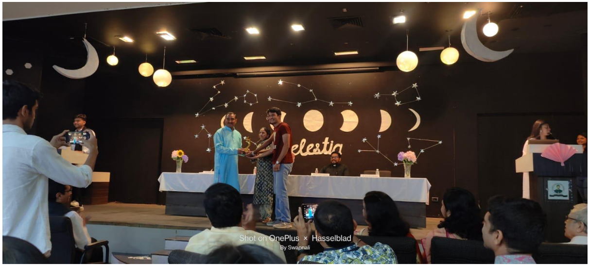
Inauguration – Euphoria (28<sup>th</sup> march 2023)