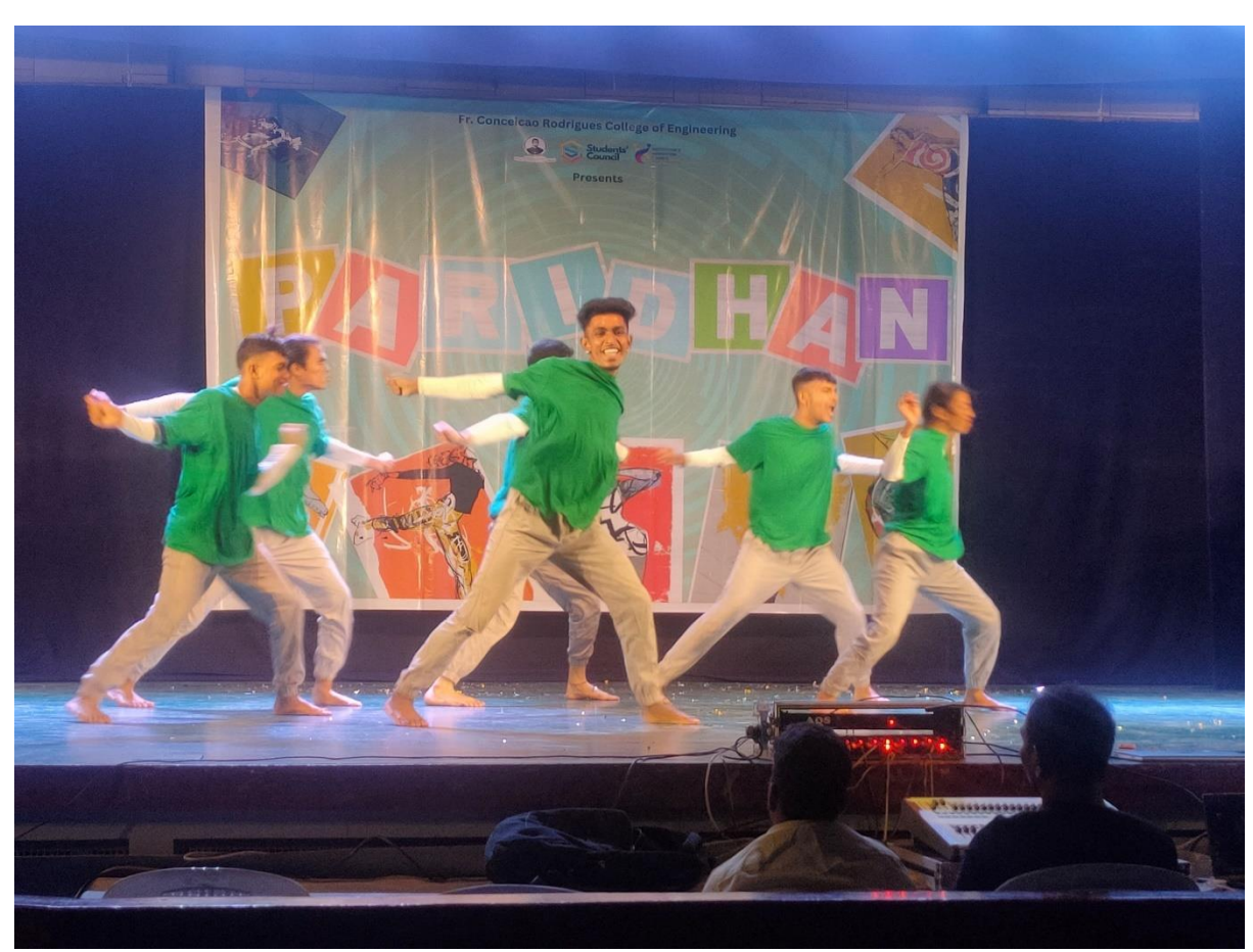
Paridhan – Dance competition (29<sup>th</sup> March 2023)