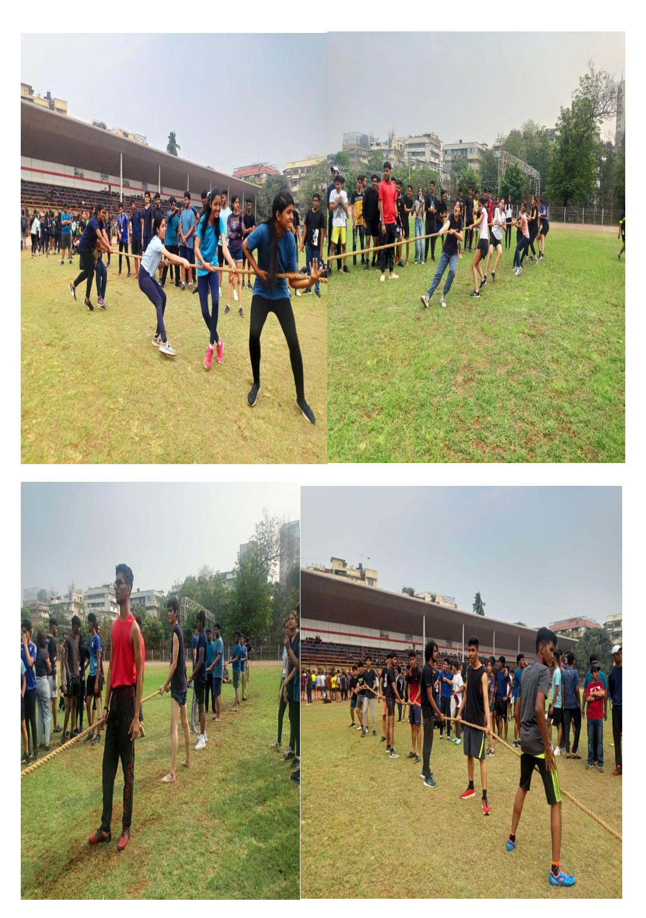
Tug of War